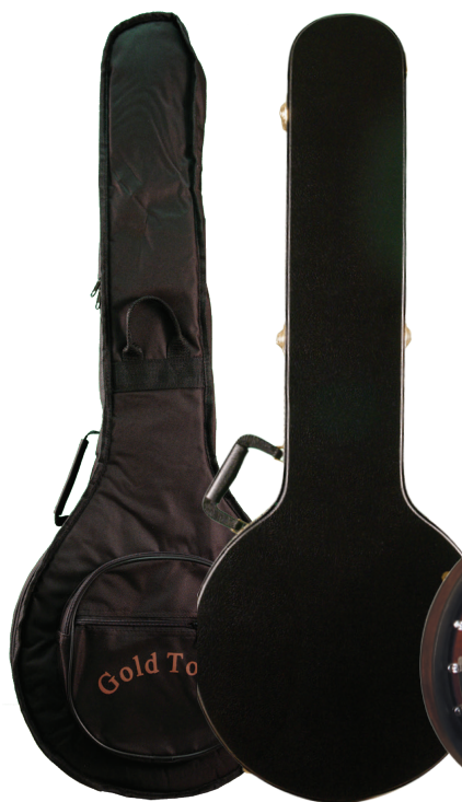
Included HD15/HD14 HDTR15-M